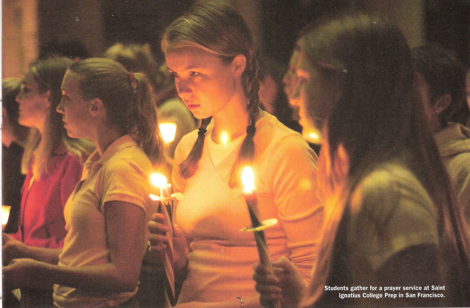
Students gather for a prayer service at Saint Ignatius College Prep in San Francisco.